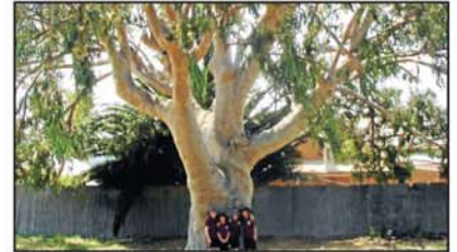
Students of St Joseph's playing under the big tree.