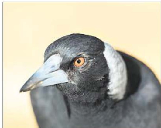
COMMON SIGHT: The magpie is just one of the thousands of species of animals and plants which call the Clarence Valley home. A project called The Atlas of Living Australia is asking for the public to upload sightings and photos of different species to build-up a better picture of Australian biodiversity.

He said sightings and photos already uploaded by people in the local area can be viewed by entering a postcode or area name which can give residents a snapshot of the flora and fauna living in their area.