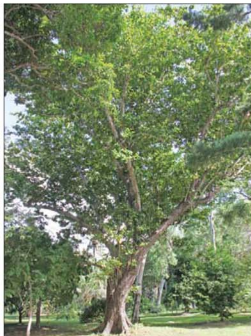
Top: This Pacific Almond ( Terminata catappa ) is also Australia's national champion in its species.

"Some will travel, both within Australia and internationally and Australia receives overseas visitors interested in our trees."