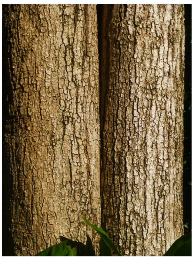
Above) twin trunked durobby bark, Broughton Hall