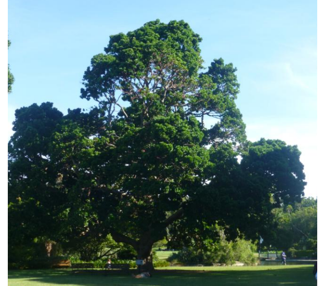
Above) Large coolamon, Sydney Botanic Garden

west is smaller, some 10 \times 8m . Both this year are heaving in flower and birds.